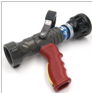
HM694RED-KIT RED W/YELLOW STRIPE GRIP

Anti-icing GREEN w/Yellow Stripe (TFT Part # HM694GRN-KIT)