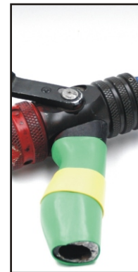
HM690GRN-KIT PISTOL GRIP COVER KIT GREEN W/YELLOW STRIPE

Deicing RED w/Yellow Stripe (TFT Part # HM690RED-KIT)