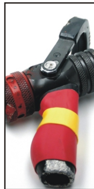
HM690RED-KIT PISTOL GRIP COVER KIT RED W/YELLOW STRIPE