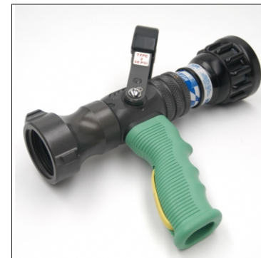
HM694GRN-KIT GREEN W/YELLOW STRIPE GRIP

Instructions will be included in each kit which will be packaged in a small zip-lock bag. The instructions will explain both the new style and old style grips and proper installation for each.